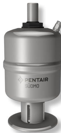
Actuator normally closed NC - normally open NO