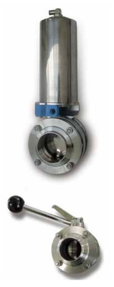
Butterfly valves with pneumatic actuator (top) and stainless steel handle (bottom)