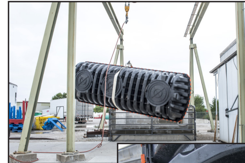
Tank cracked, clips on seam were dislodged.

Disadvantage: Assembly error or part failure can cause tank to fail