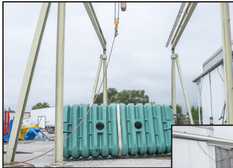
D2 has no cracking.

Advantage: No additional support is required.