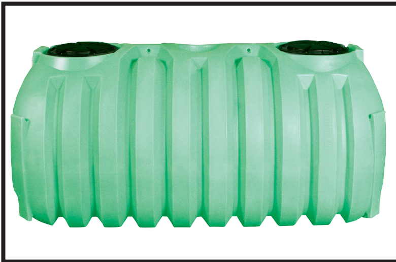
One-piece Seamless Tank